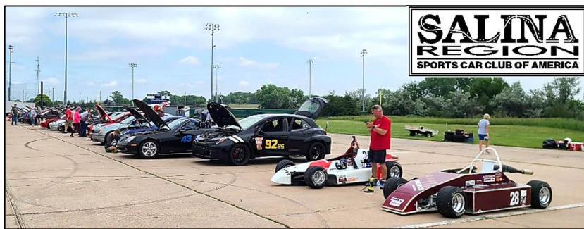
Divisional Championship, Grid A

The official newsletter of the Salina Region SCCA