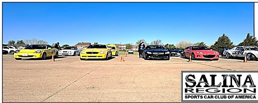
April event grid

The official newsletter of the Salina Region SCCA