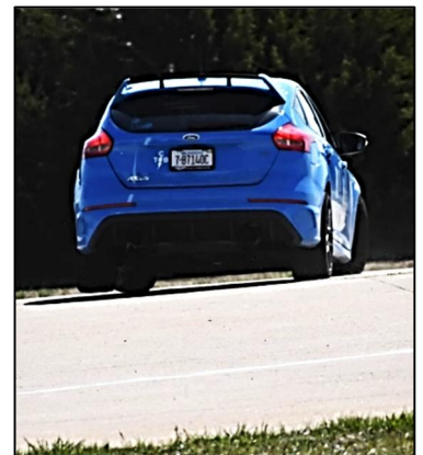
Ivy Chang, 2nd DS, Ford Focus