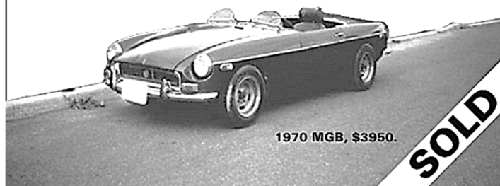
1970 MGB, $3950.

Brooklands Racing Aeroscreens: Priceless