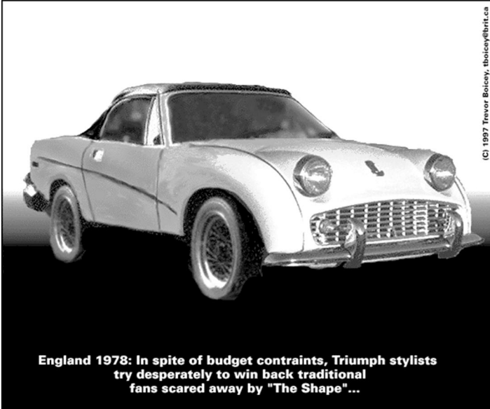
England 1978: In spite of budget constraints, Triumph stylists try desperately to win back traditional fans scared away by "The Shape"...

What's shown here is a mashup of the Triumph TR7 sides with the Triumph TR3 front end. The TR3 ceased production in 1962 while the wedge-shaped TR7 came out in 1974 marketed as "The shape of things to come."